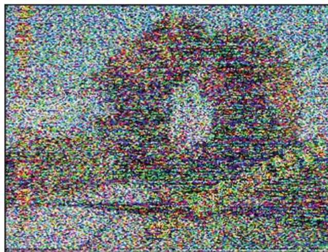
Figure 10. P1 with 7.64% pixel match

For those who wish to conduct their own image studies, a web-based ImageMagick routine that was developed for this