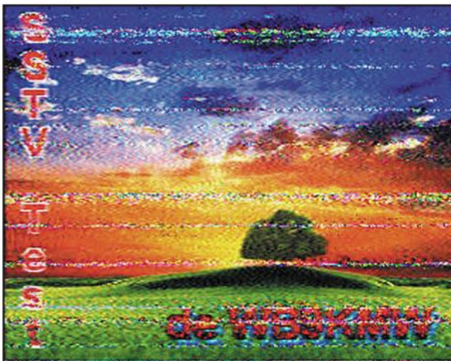
Figure 8. P3 image with 65.05% pixel match to original

One needs to find some way to categorize the picture quality percentages. This can be accomplished by utilizing a normal statistical distribution curve and