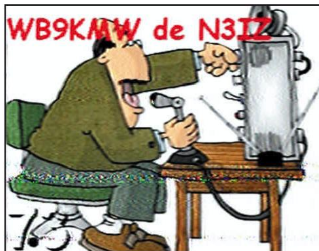
Figure 2. P4: Good, some noise