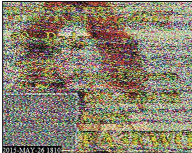
Figure 5. P1: Text is barely visible