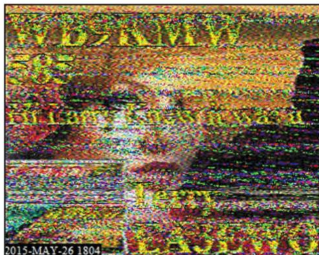
Figure 4. P2: Barely usable, noisy