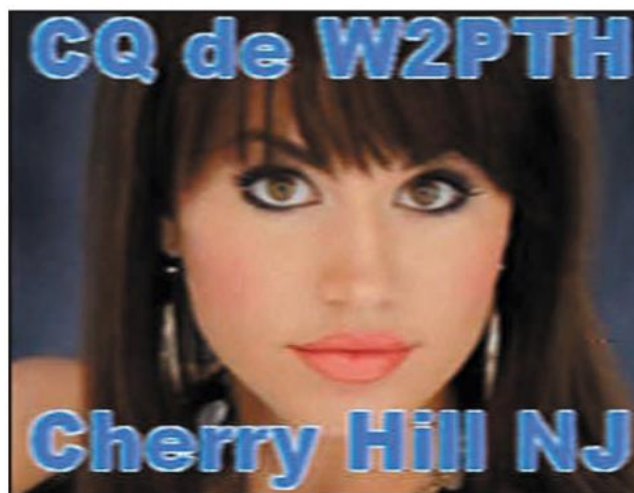
Figure 1. P5: Broadcast quality

When describing SSTV image quality, one should look for a simple, easy-to-assess description of any received image,