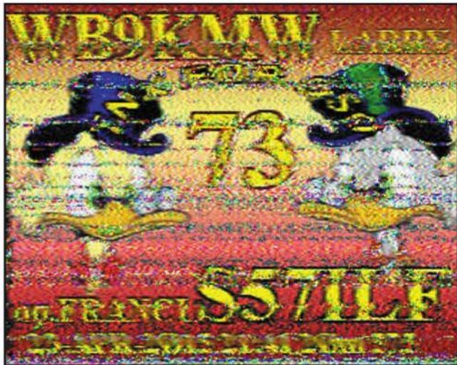
Figure 3. P3: Usable, but noisy