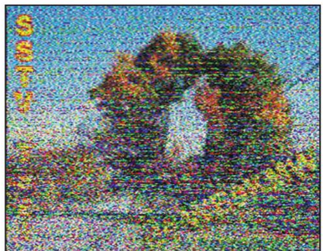
Figure 9. P2 with 25.78% pixel match