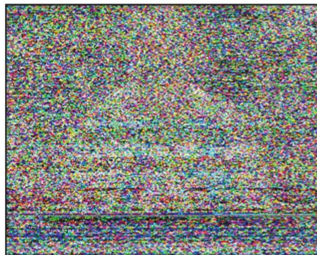
Figure 6. P0: Unusable

given degradation that occurs from a radio transmission. This degradation from the originally transmitted signal arises in many ways: