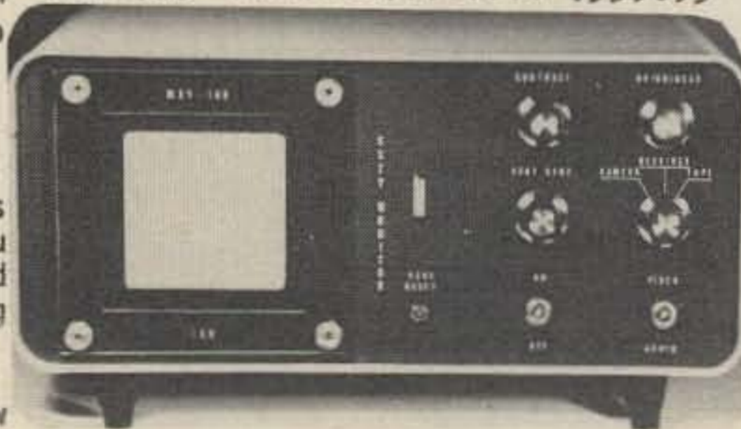
MXV-100 MONITOR..... $339.95

WE ONLY USE THE FINEST NEW PARTS IN OUR EQUIPMENT